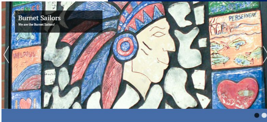
← Banner Image 1200x480